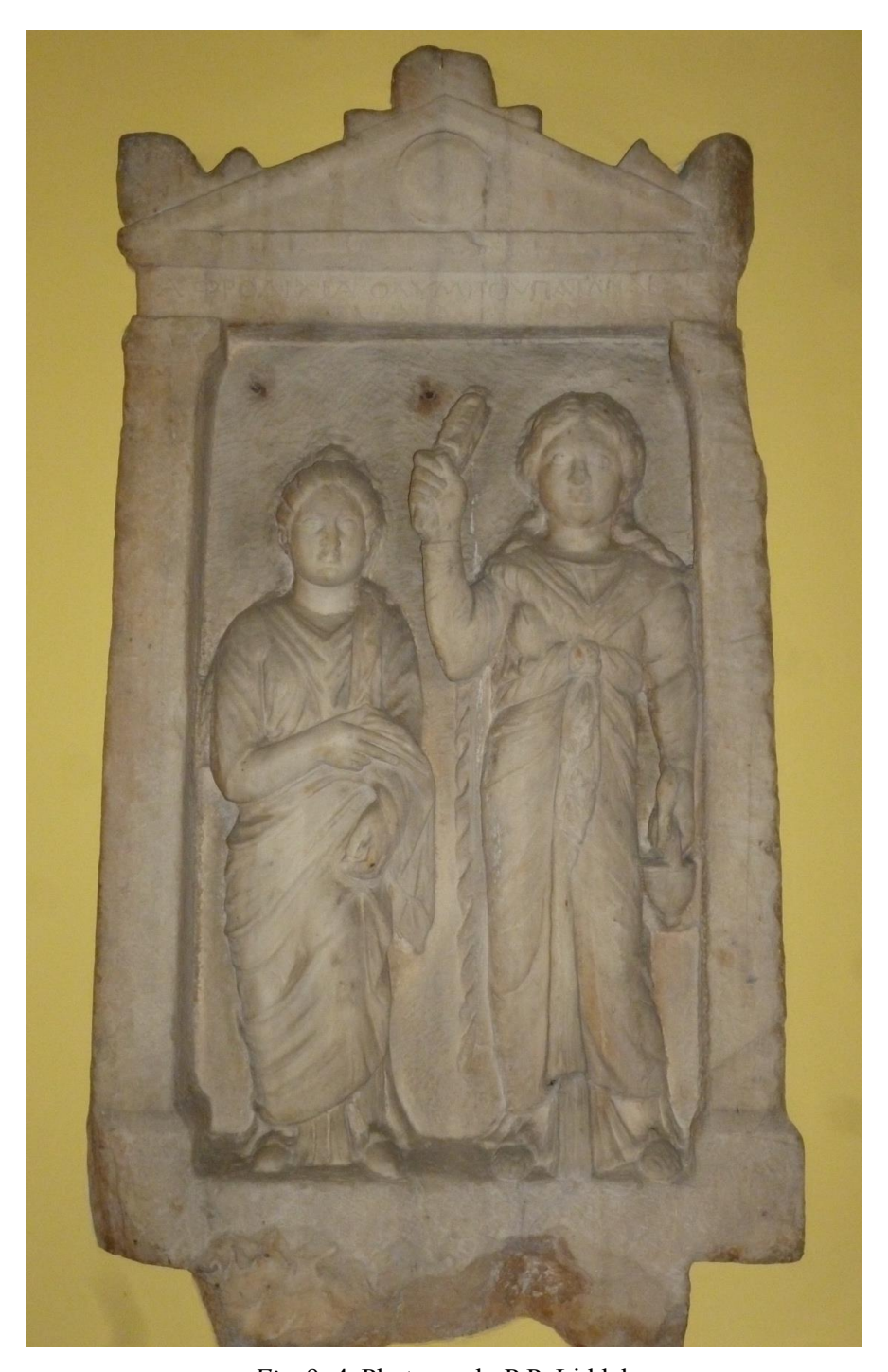
Fig. 9. 4.

the third century AD.<sup>90</sup> The square-ish shape of the letters of the left-hand inscription and hyperextended diagonals also suggest a date in the early third century;<sup>91</sup> the lunate sigma of the right-hand inscription suggests a slightly later date.