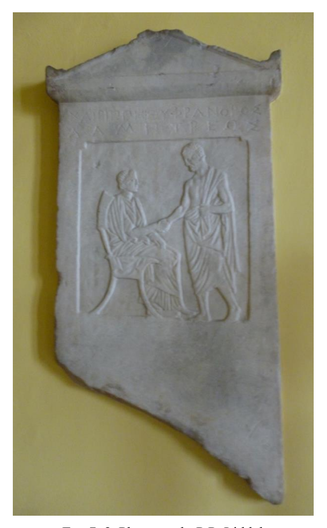
Fig. 7. 3.

Clairmont suggested a date in the second quarter of the fourth century BC, Scholl the period 340-320 on the basis of the style of the relief. Ca. 375-320 BC seems compatible with the style of the lettering.