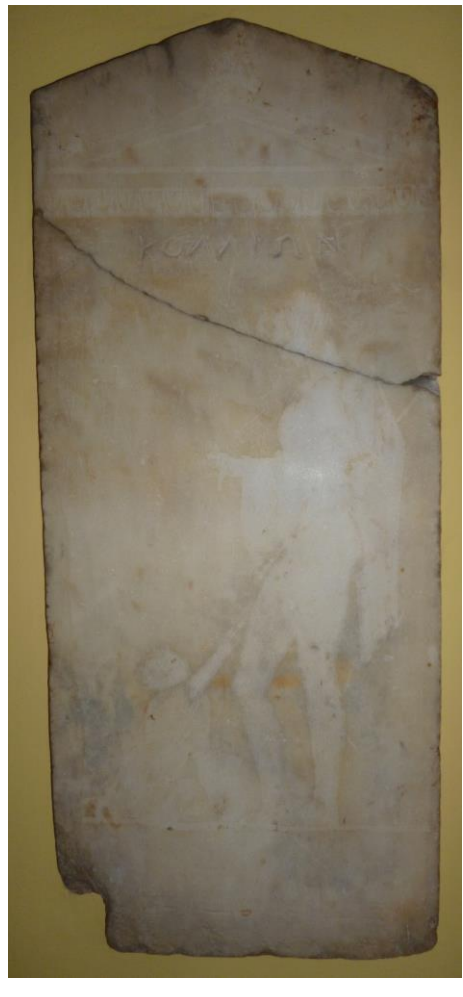
Fig. 1. 1.