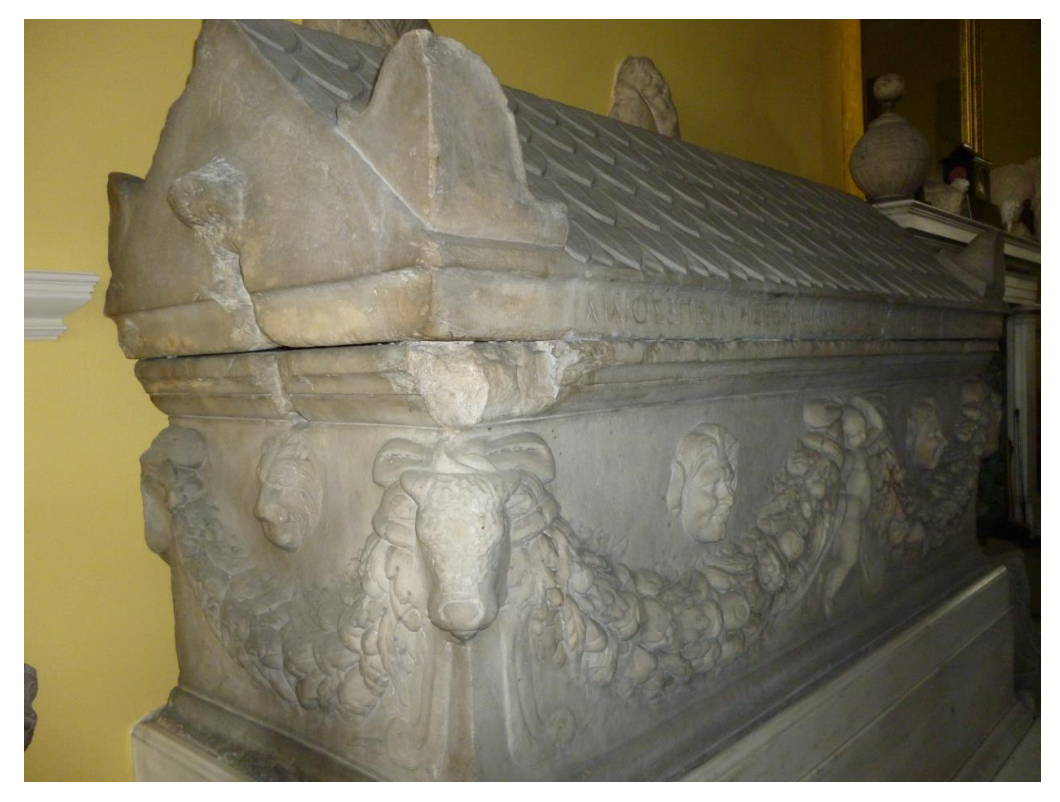
Fig. 12. 5. Corner view.