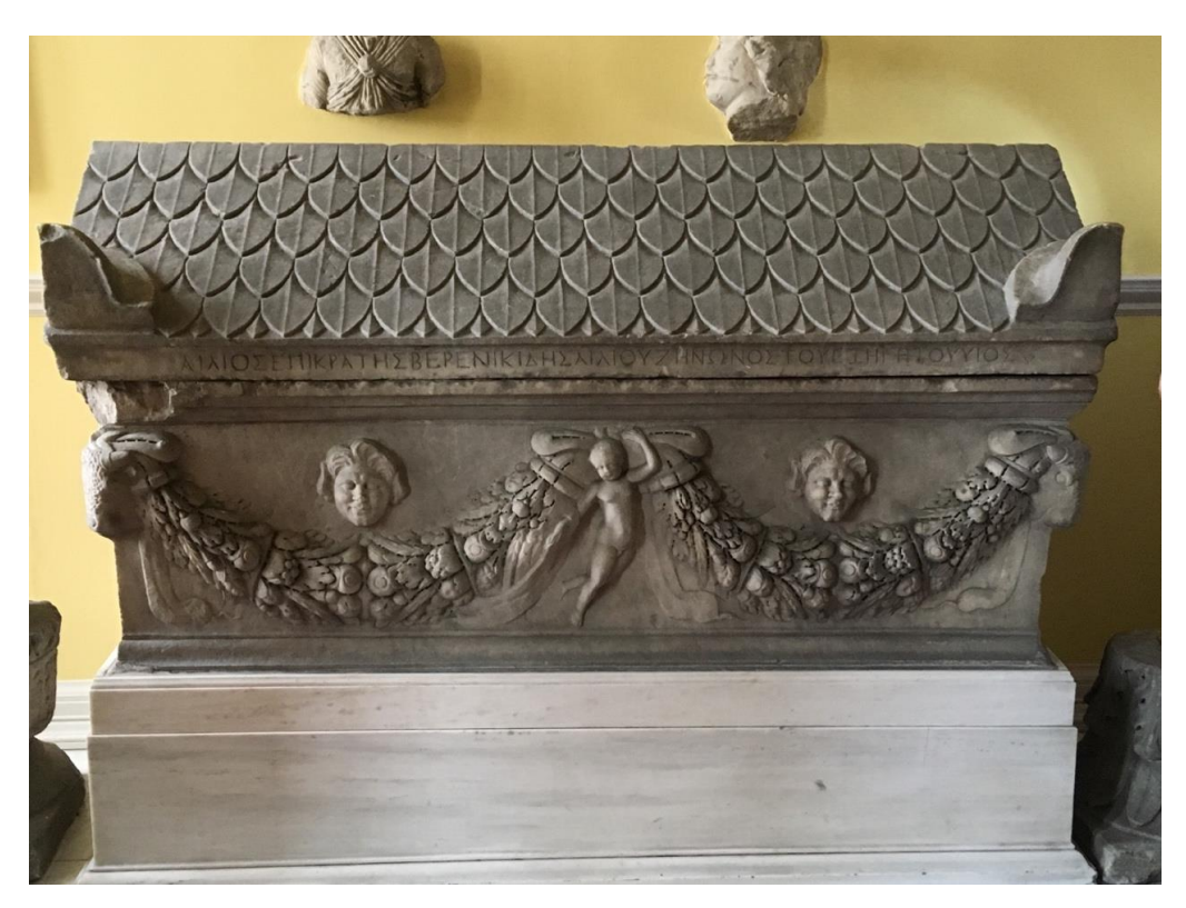
Fig. 11. 5.

by perhaps as much as a century: we may thus have another example of a funerary monument embellished with an inscription at the time of its re-use.