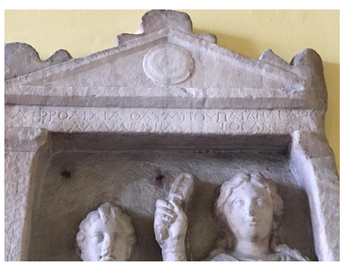
Fig. 10. 4. detail.