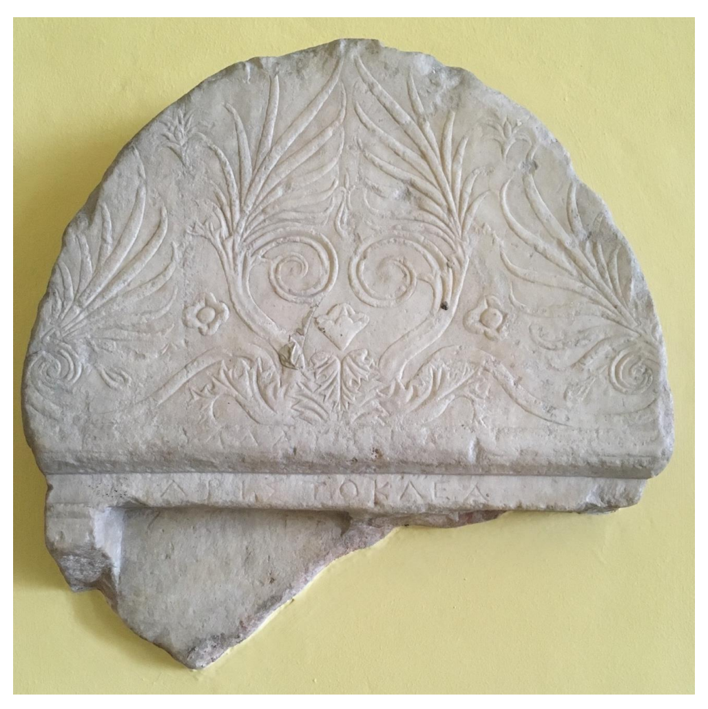
Fig. 6. 2.

Michaelis dated the monument in its original form to the late fifth or early fourth centuries BC. Möbius (37 n. 36; 88) dated it to 365-40 BC on the basis of its decorations, comparing the epitaph for Philyra the wet-nurse ( IG II<sup>2</sup> 12996, first quarter of the fourth century; for an illustration, see Hildebrandt, no. 222). Hildebrandt, 47, proposes a slightly broader dating framework, noting that this form of decoration is predominantly associated with monuments of the first half of the fourth century, but does appear on some stelai of the third quarter of the century. A date ca. 400-330 BC is also compatible with the style of the lettering.