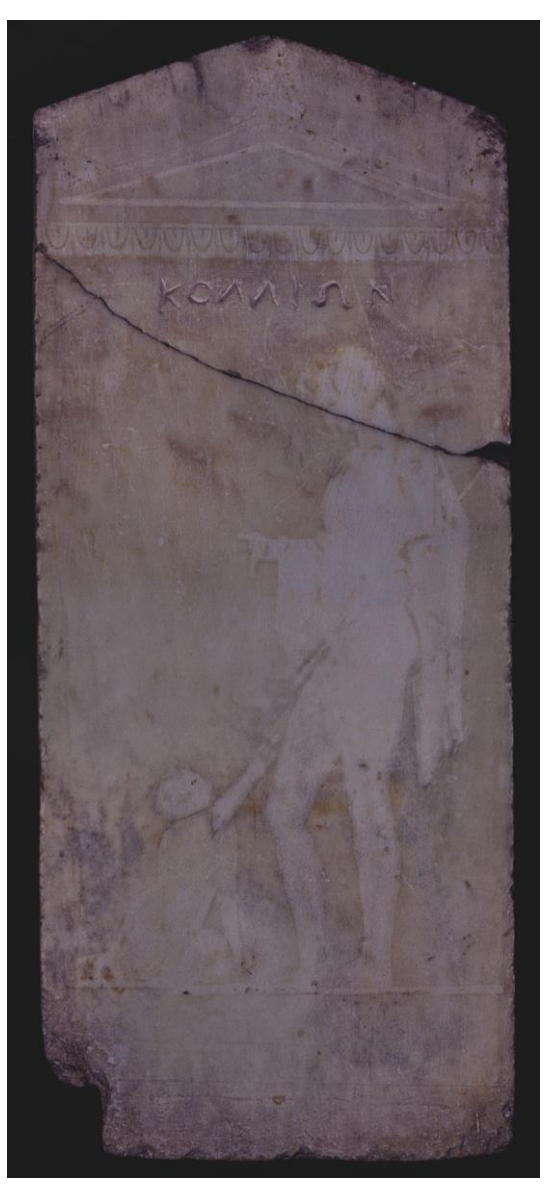
Fig. 4. 1.