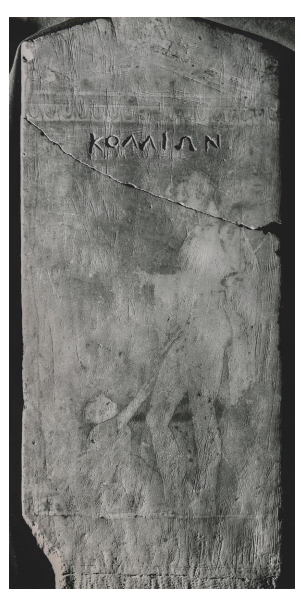
Fig. 5. 1. Photograph (Ultra-Violet Reflectography + raking light): R. Posamentir.