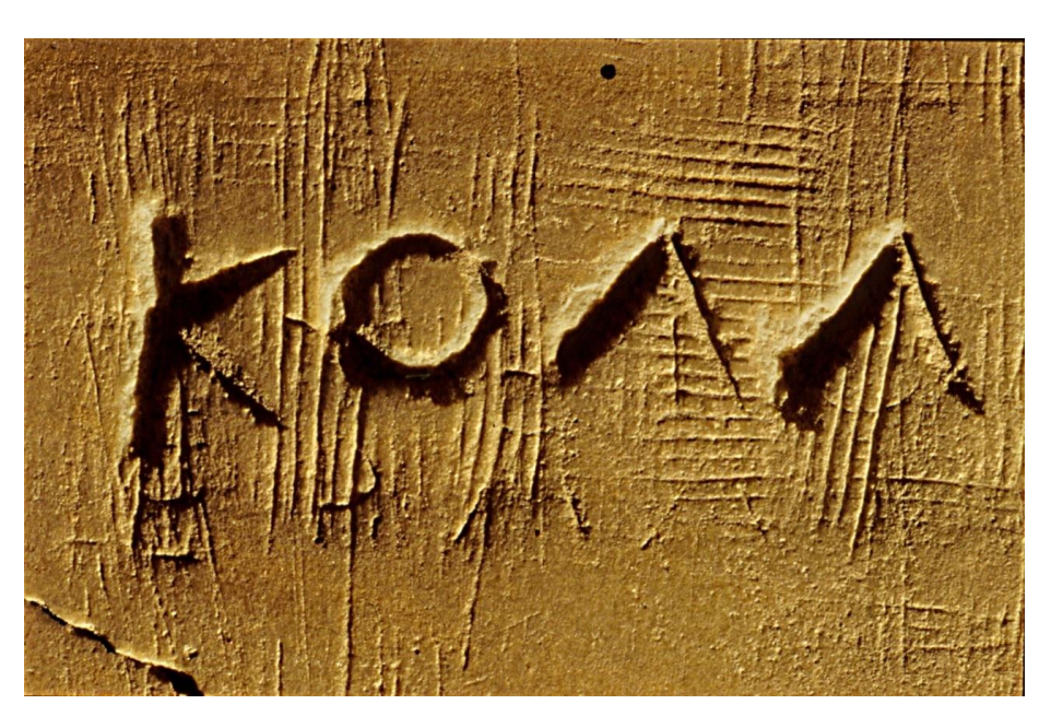
Fig. 3. 1. Photograph of inscribed area (raking light shot with ektachrome material): R. Posamentir.