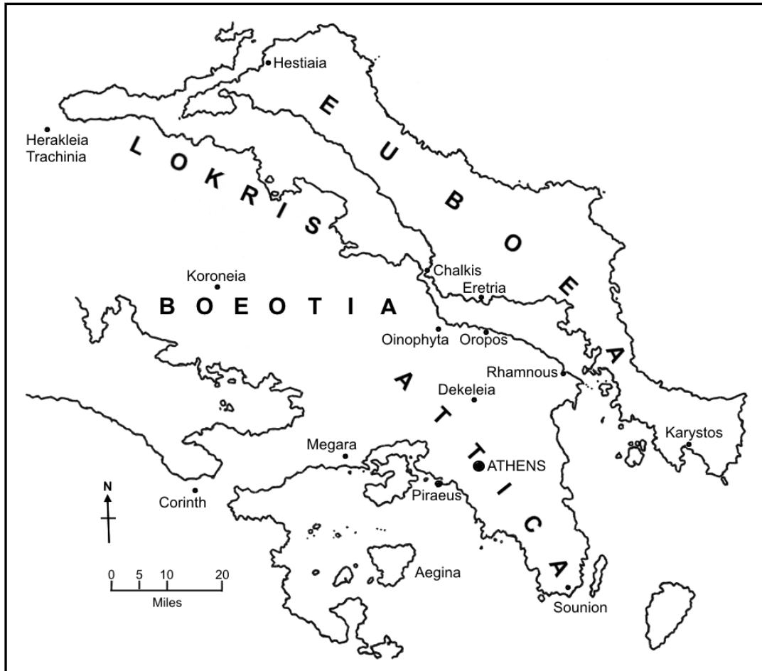
Fig. 1. Map of Attica and Euboea (drawn by Terry Abbott)