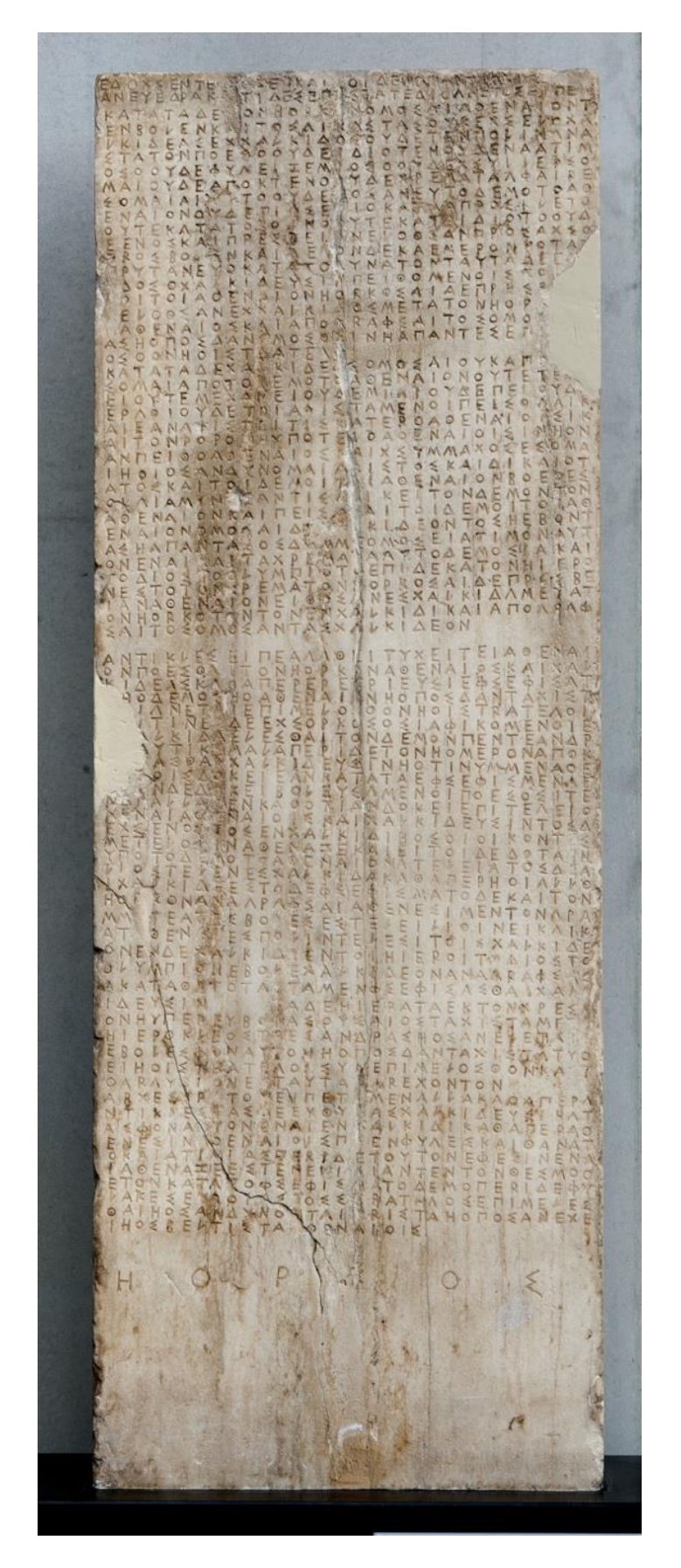
Fig. 2. Chalkis decrees, IG I<sup>3</sup> 40 = Acrop. 6509