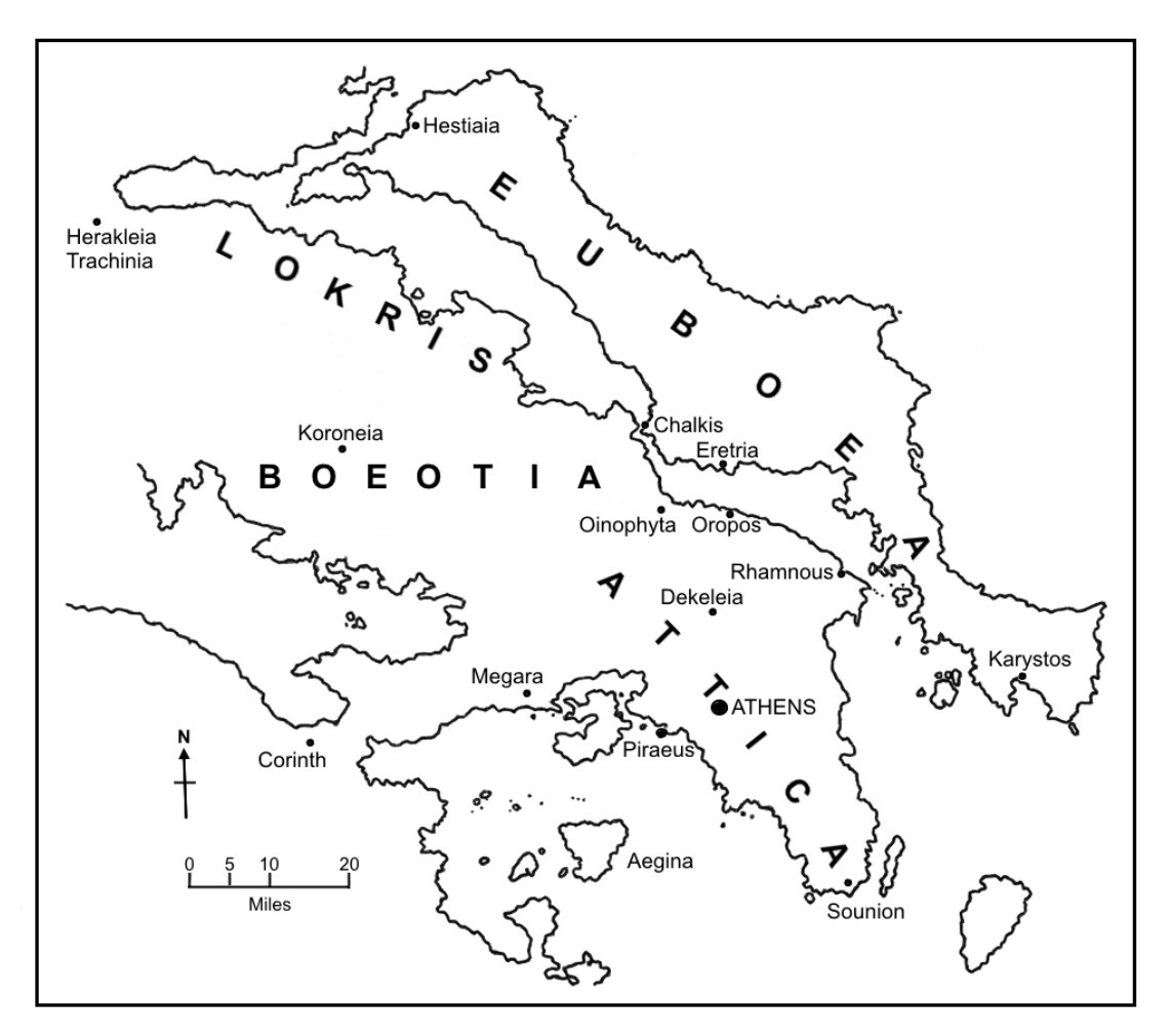
Fig. 1. Map of Attica and Euboea (drawn by Terry Abbott)