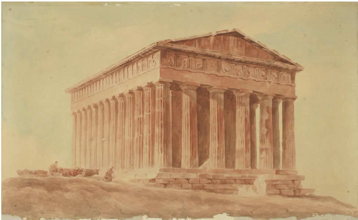
Fig. 1. Mary Hamilton Campbell, “Temple of Theseus”. National Galleries Scotland (Lady Ruthven Bequest), D NG 712. (CC BY-NC 2.0.)

reporters to view the new acquisitions. 29 The inscriptions remained on display until 1946, when, in response to increasing pressure on space in the Gallery, they were sent (along with “a number of classical, medieval and oriental works”) on long-term loan to the Royal Scottish Museum (now the National Museum of Scotland). 30 They were returned to the National Gallery in 1988, and were again put on display until 2010, at which point they were transferred to the stores. 31