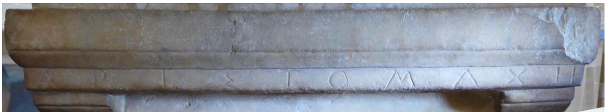
Fig. 3. 1. Edinburgh, National Gallery 686. Detail of inscription.