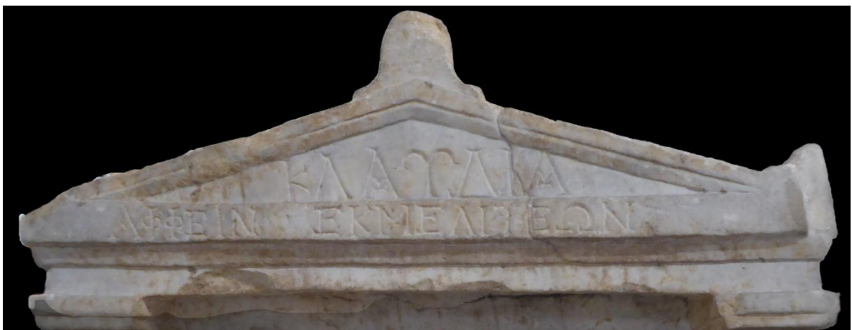
Fig. 5. 2. Edinburgh, National Gallery 687. Detail of inscription.