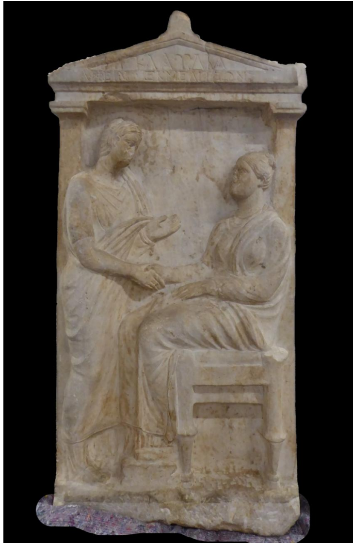
Fig. 4. 2. Edinburgh, National Gallery 687.