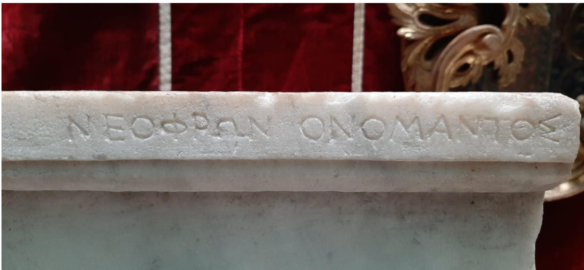
Fig. 5. 1 = NT 1220123 (detail, right-hand inscription).