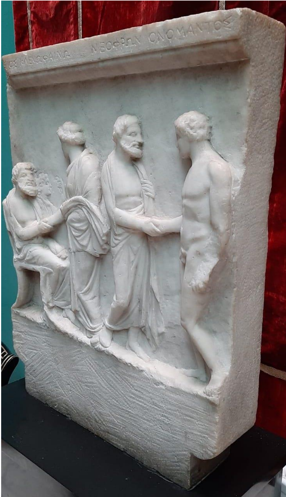
Fig. 3. 1 = NT 1220123 (illustrating depth of relief).