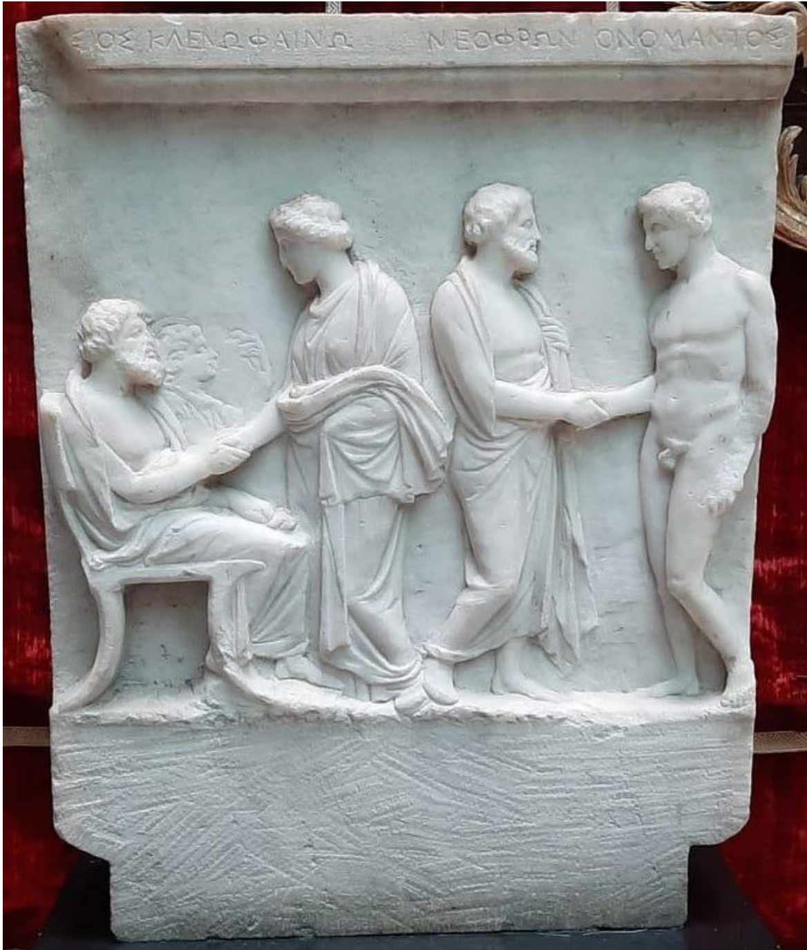
Fig. 1. 1 = NT 1220123.