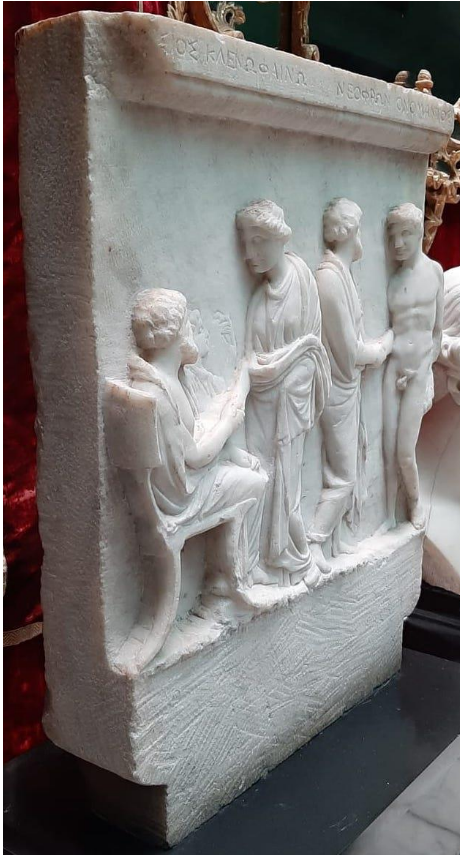
Fig. 2. 1 = NT 1220123 (illustrating depth of relief).