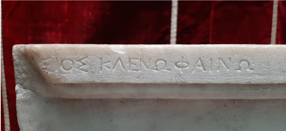
Fig. 4. 1 = NT 1220123 (detail, left-hand inscription).