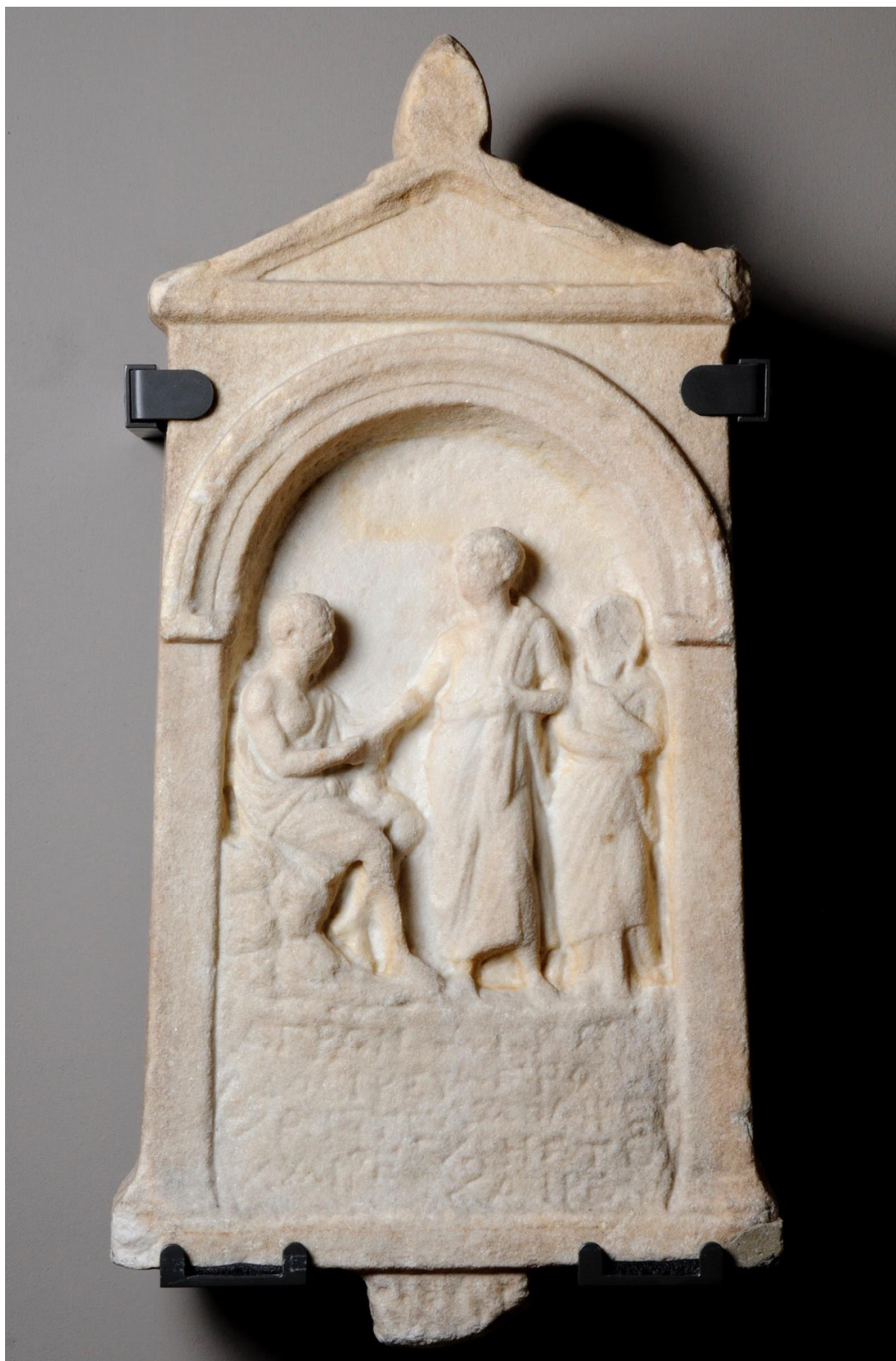
Fig. 4. Appendix.

Ἄγρων in lines 1 and 5 and Ἄγρωνος in line 6. This is clearly preferable to the text printed in IG , which has [Π]άτρων and [Π]άτρωνος.