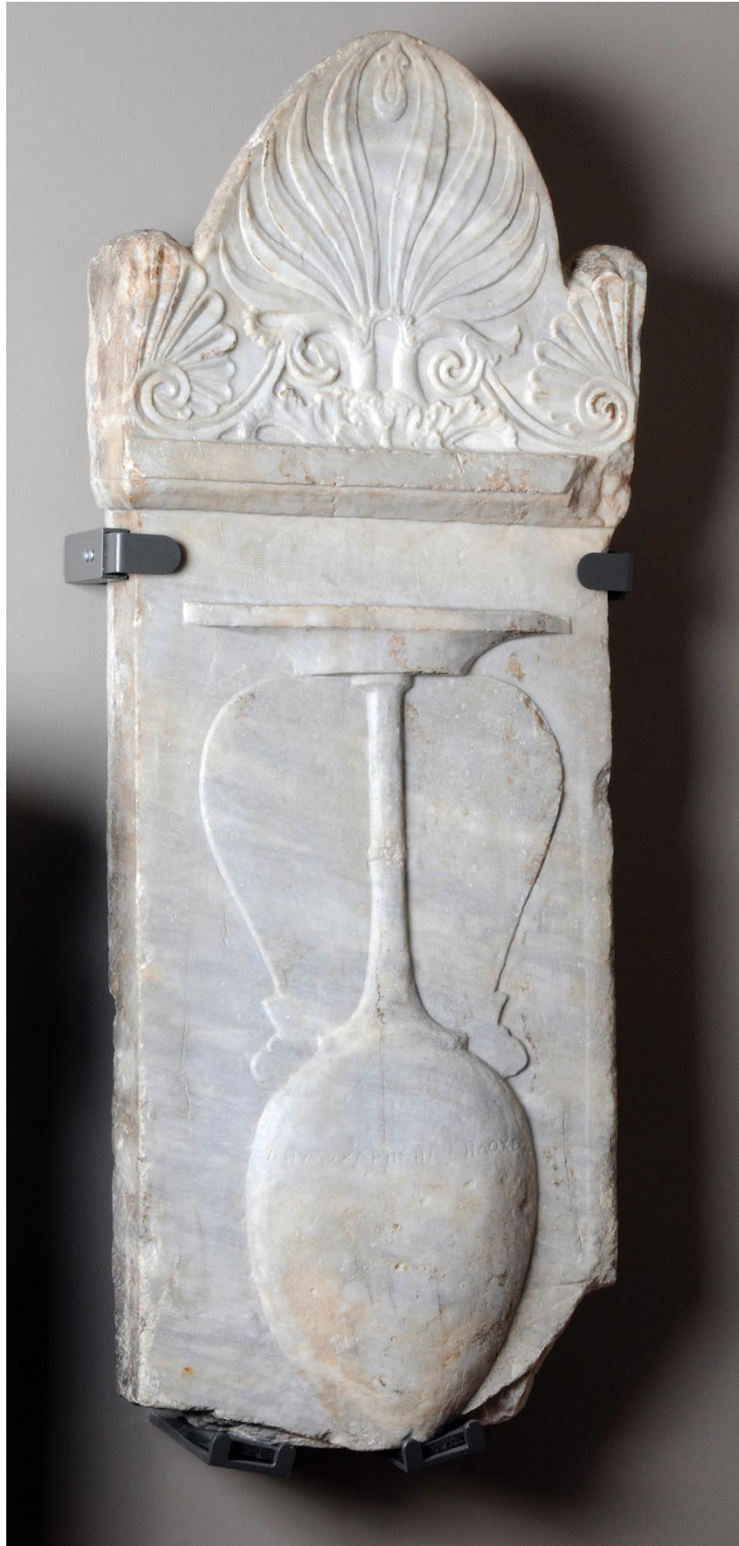
Fig. 1. 1