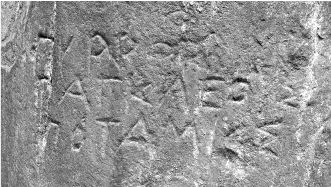
Fig. 4. 1 , detail of Inscription A. Chatsworth. Photograph no. FA 1276-10.