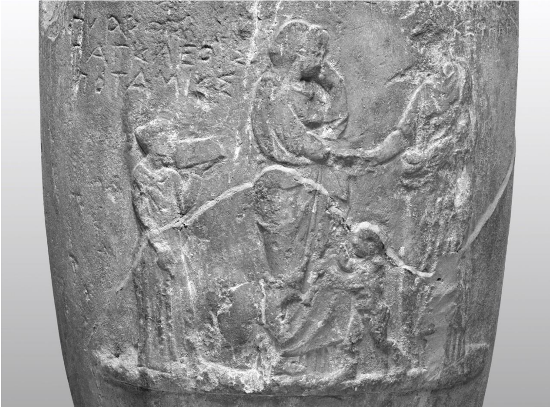
Fig. 6. 1, relief. Chatsworth. © Forschungsarchiv für Antike Plastik. Köln. Photograph no. FA 1276-10. Photograph: R. Laev.