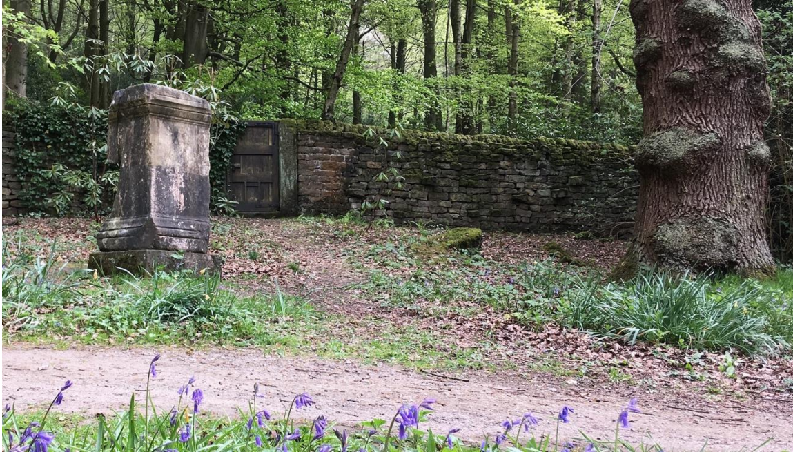
Fig. 2. 2, current setting, Chatsworth Garden.

Melos and Delos, where he collected some “fragments”; 13 the same letter reports that he spent two weeks in Athens in the same year. Although he does not mention this statue base specifically, it seems reasonable to assume that it was acquired on this visit. 14