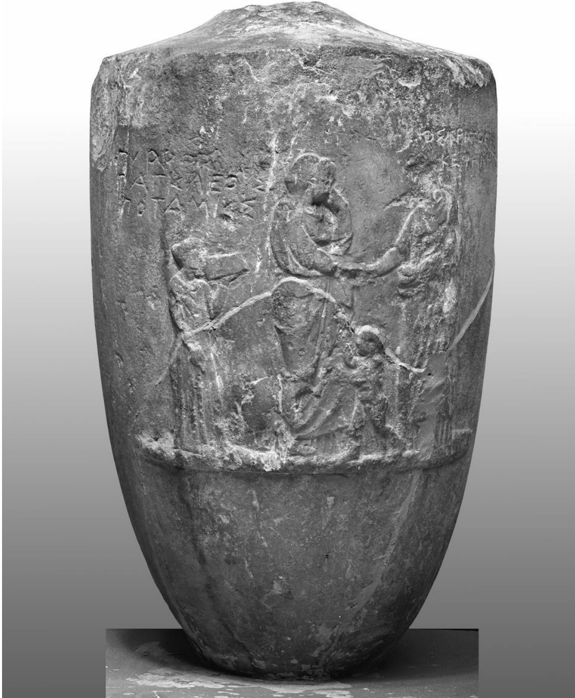
Fig. 3. 1. Chatsworth. © Forschungsarchiv für Antike Plastik. Köln. Photograph no. FA 1276-10. Photograph: R. Laev.

tied to membership in the hoplite class or was accessible to Athenians of all classes before 321 BC, it seems likely that participation was proportionately higher among wealthier groups. 44