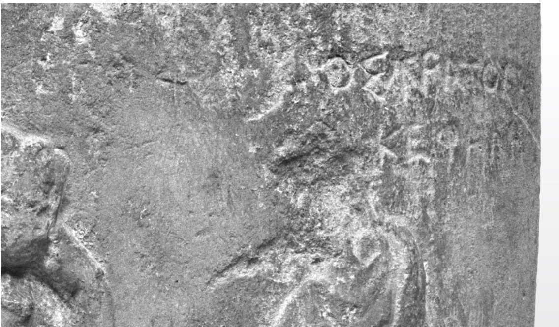
Fig. 5. 1 , detail of Inscription B. Chatsworth. © Forschungsarchiv für Antike Plastik. Köln. Photograph no. FA 1276-10. Photograph: R. Laev.