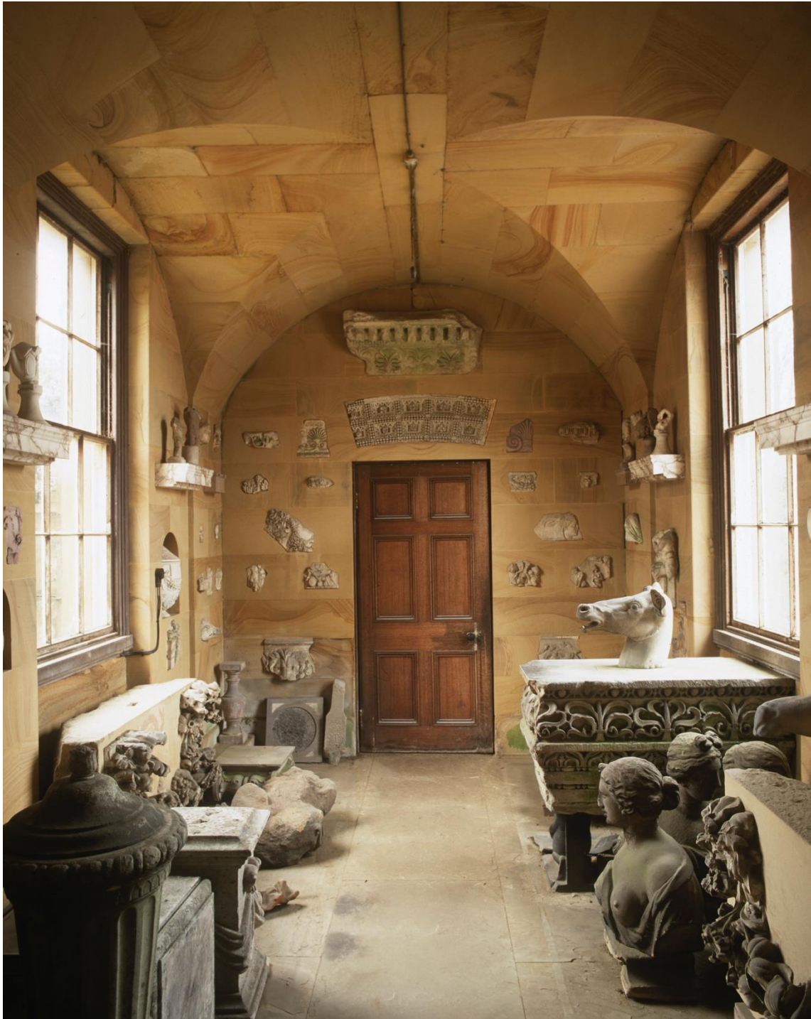
Fig. 1. The “Lodge of Fragments” (or West Lodge), Chatsworth.

older sister Harriet. The Handbook contains a catalogue of the contents of the “Lodge of Fragments” (based on Westmacott’s list, and, the Duke notes, not updated to reflect acquisitions made since then: Handbook , 150); it also provides vivid descriptions (including details of provenance) of some – but unfortunately not all – of the antiquities located elsewhere in the house and gardens.