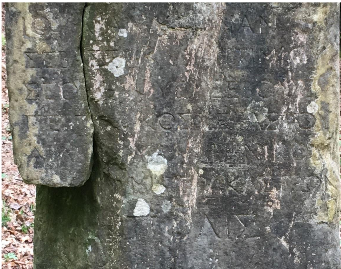
Fig. 8. 2, inscribed text. Chatsworth.