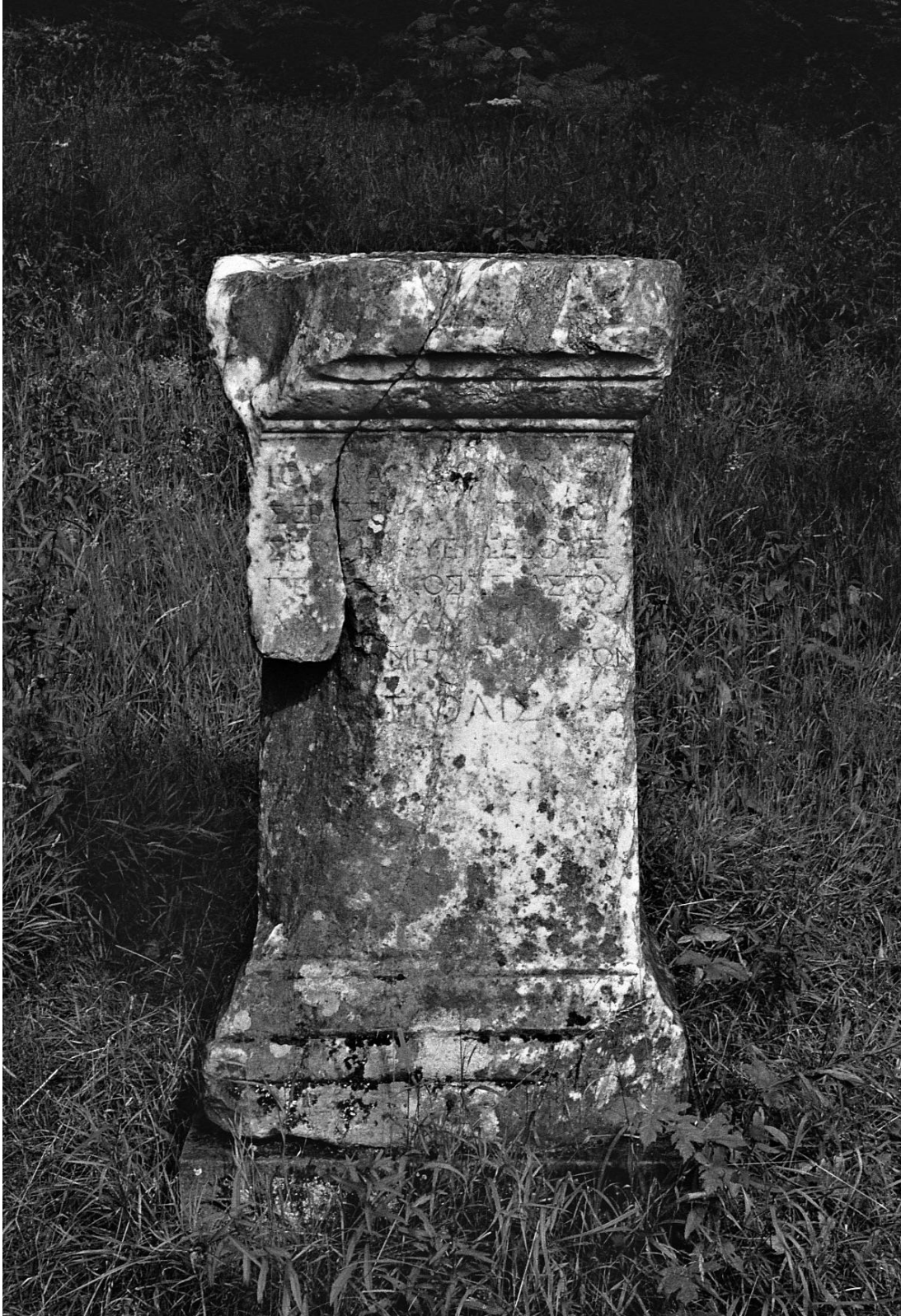
Fig. 7. 2. Chatsworth. Scan no. 4224.

of the 1980s found the base “none the worse for the experience”, sc. of having been buried in and excavated from the undergrowth).